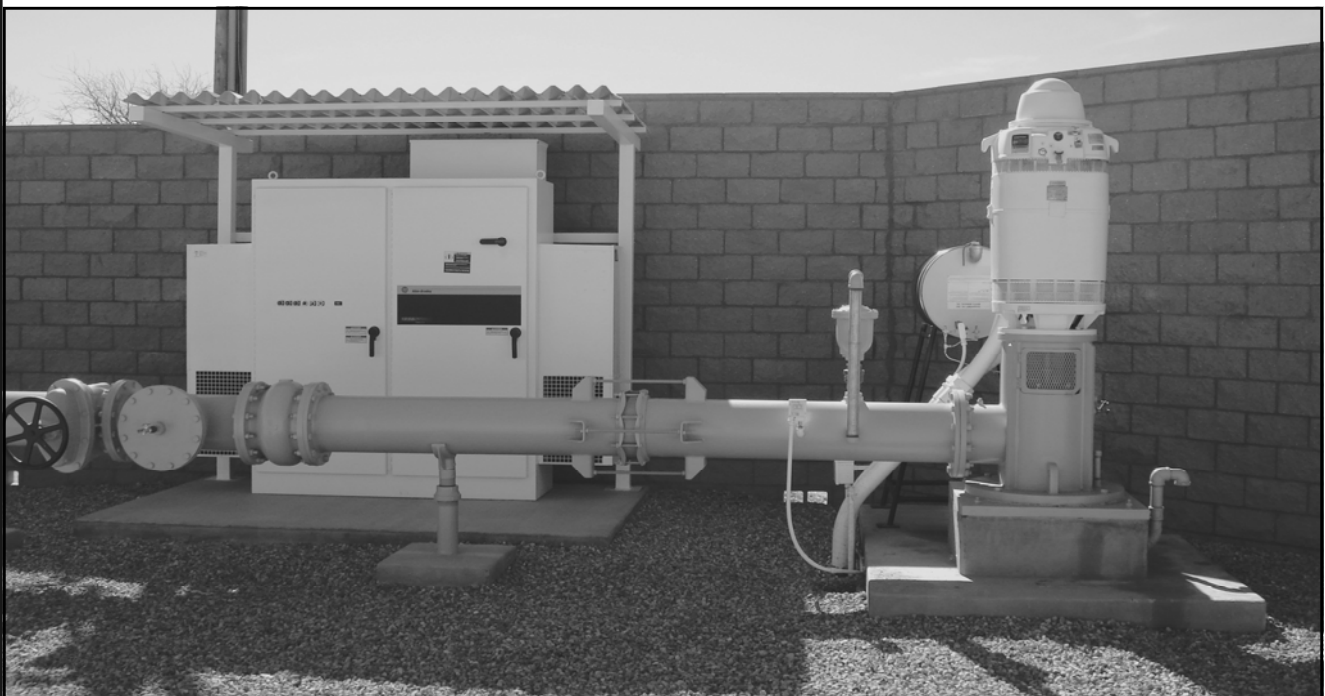
Community Water Company's #10 well was put into use in December of 2006

A hazardous waste collection occurs in Green Valley, periodically each year. The Green Valley Community Coordinating Council typically announces the date, time, and location of the scheduled collections. Call 648-1936 for more information.