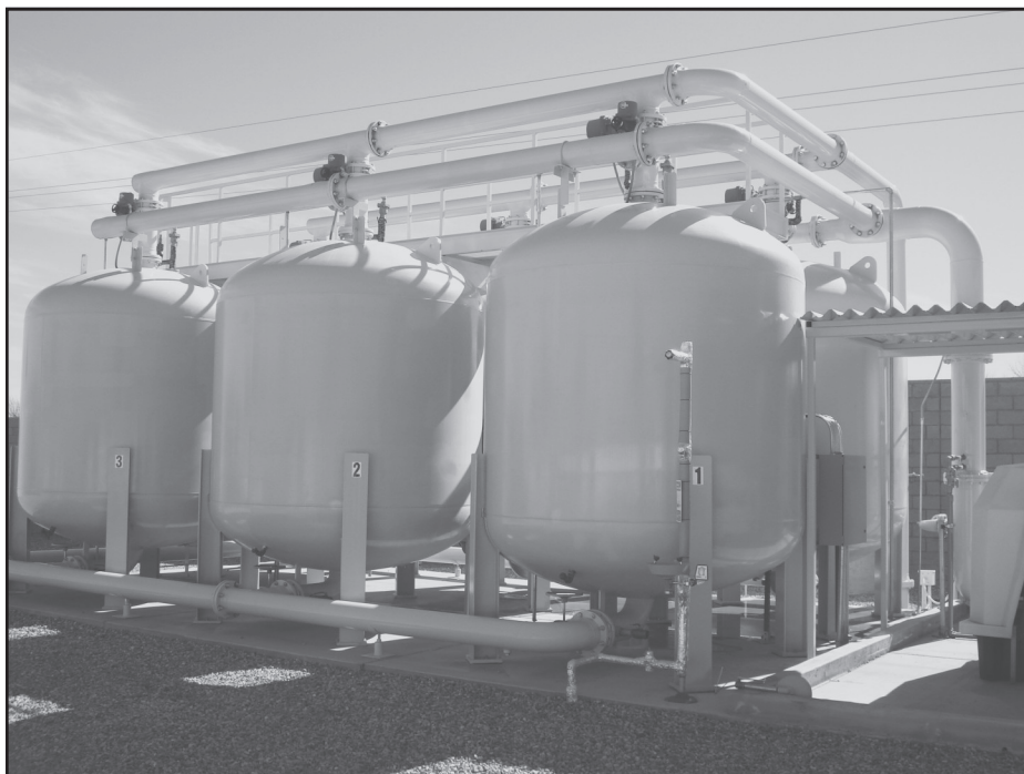
Community Water Company's #10 well arsenic treatment plant was put into service in December of 2006

A hazardous waste collection occurs in Green Valley, periodically each year. The Green Valley Community Coordinating Council typically announces the date, time, and location of the scheduled collections. Call 648-1936 for more information.